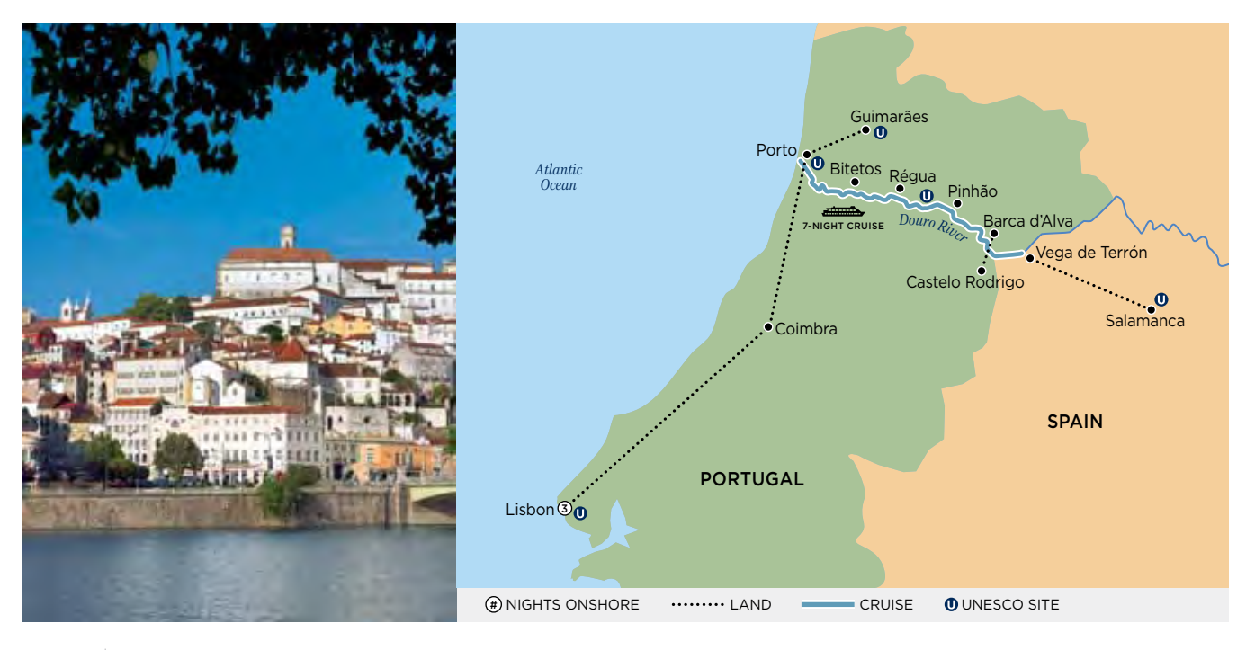
Portugal | Spain